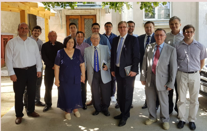
The 10th year meeting of the 2008 promotion